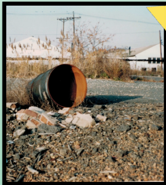
CIC Superfund Site BEFORE